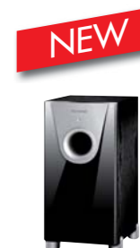
SUB 63 aktiv