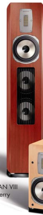
ORKAN VIII cherry