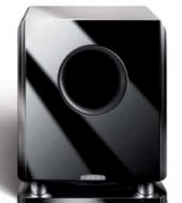
ORKUS high-gloss black

Sound: ABSOLUTELY TOP CLASS „The MK VII is the best Titan of all time by a long way ...“ stereoplay 06/2006 (Germany)