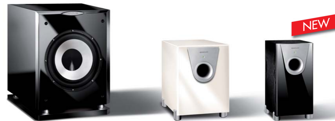
SUB 700 DV aktiv