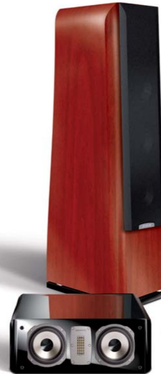
BASE VIII high-gloss black