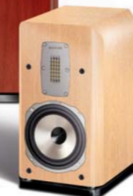
ALTAN VIII oak nature