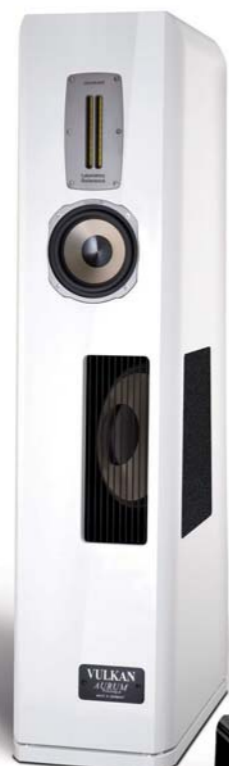
VULKAN VIII high-gloss white