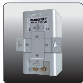
Wallmount included at 330W and 220W

Compact as they are, the MAXI speakers perform bigger than their size suggests, offering lots of musicality and finesse. Whether listening to music, home theatre, entertaining or partying, the MAXI speakers never fail to impress.