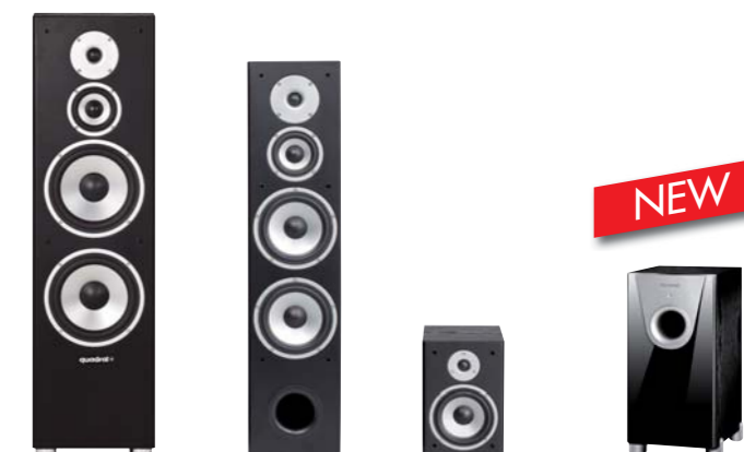
505 Front 6000

The appealing design and flawless craftsmanship of quadral's QUINTAS 6000 and 5000 surround set pleases the eye, while the speakers' effervescent dynamics and tonal balance bring pure listening enjoyment. Frugal listeners get an ideal combination of high-quality music and film soundtrack reproduction. The set's full-grown upright speakers produce respectable bass volume, so you can dispense with an additional subwoofer. The central speaker boasts impressive speech intelligibility and acoustically neutral music reproduction, while the rear satellites provide a spectacular surround effect.