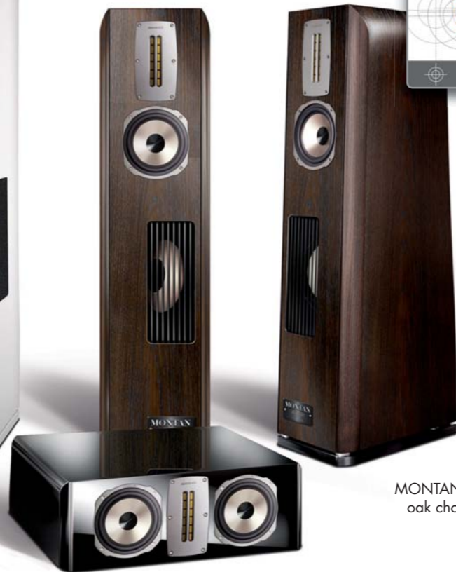
MONTAN VIII oak choco