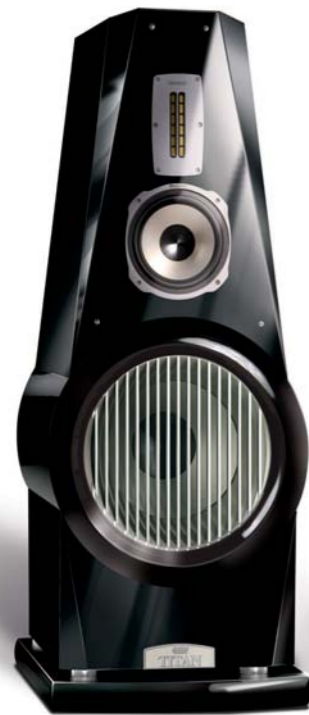
TITAN VII high-gloss black