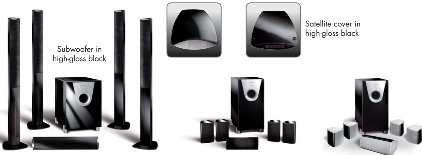
Subwoofer in high-gloss black