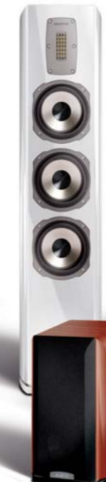
MEGAN VIII cherry