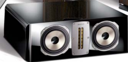
BASE PRESTIGE VIII high-gloss black