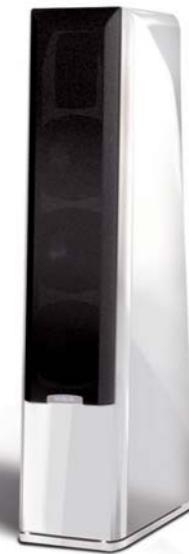
WOTAN VIII high-gloss white